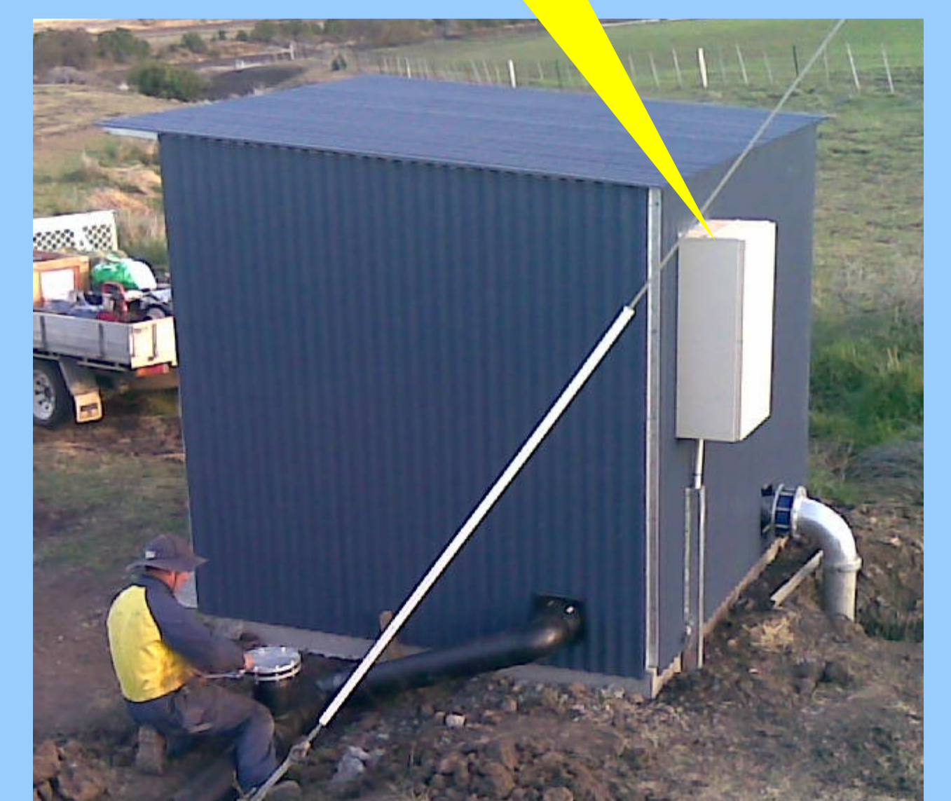
Open Bus-stop style Pump-Shed

For more information about Pump-Shed Contact