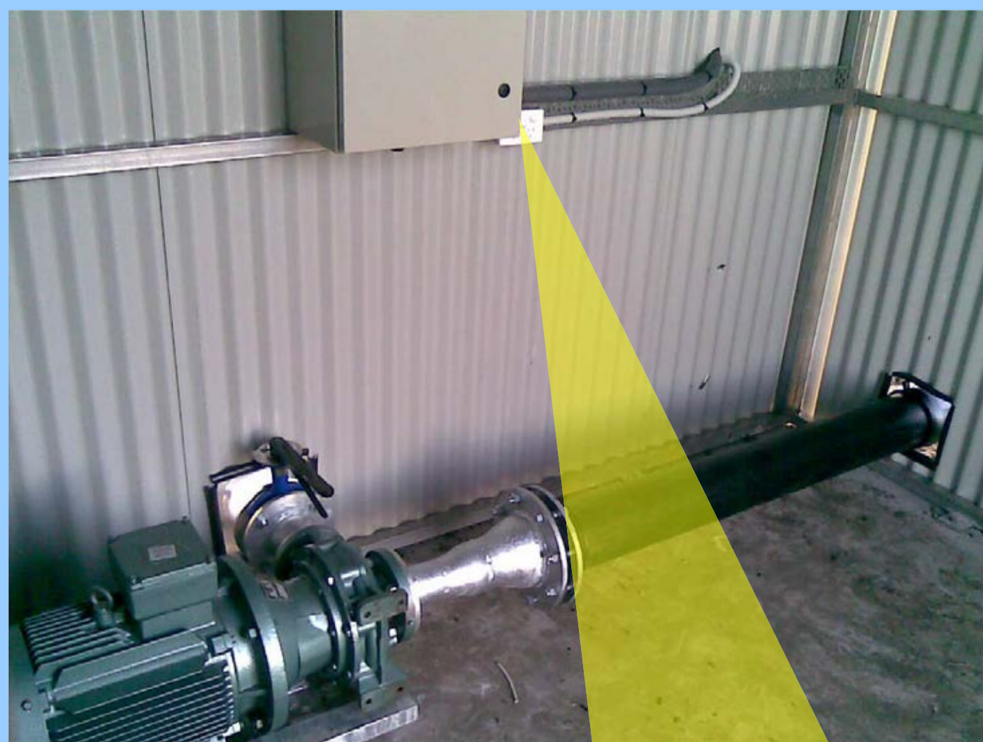
Easily Mount Starters / VSD's